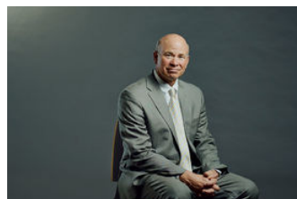
Gorman's Game Plan