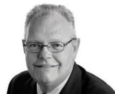
Pedcor Back to Full Strength Post-Recession