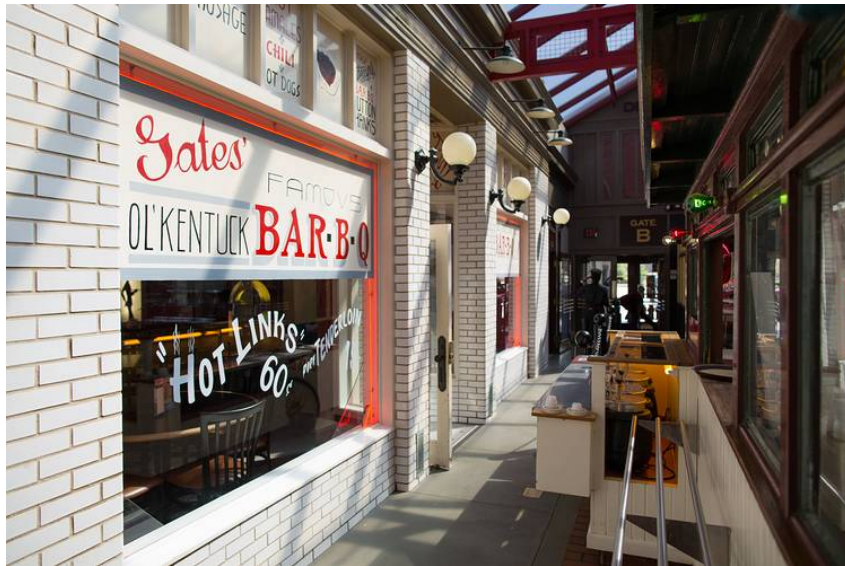
Gates Bar-B-Q

Owner/designer of Kansas City-based Baldwin Denim & Collection