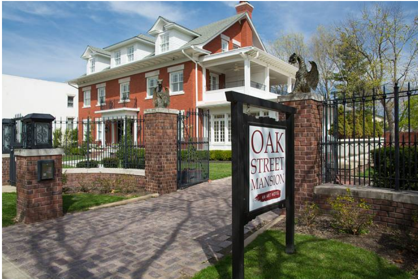
Oak Street Mansion

the hotel's black-tie events. 901 W. 48th Place, hotelsorella- countryclubplaza.com